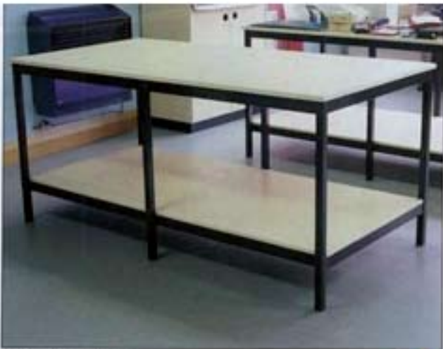
B-81 - Bench - Pottery 1770 x 885 x 800

Please note, the B-78, B-79, B-85 to B-87 and B-190 feature a hardwearing tempered masonite worksurface.