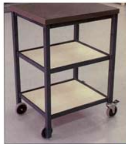
B-87 - Bench - Mobile - Tool 585 x 495 x 860