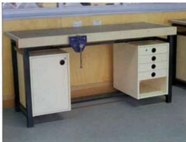
B-86 - Bench - Workshop Demonstration 1170 x 645 x 890