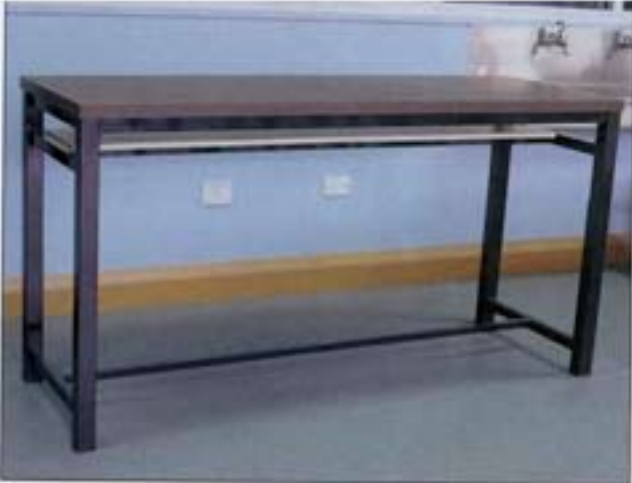
B-85 - Bench - Multi Purpose 1710 x 585 x 890 Note - without the shelf and at a lower height this bench is known as: B-190 - Bench - Technical Drawing 1710 x 585 x 720