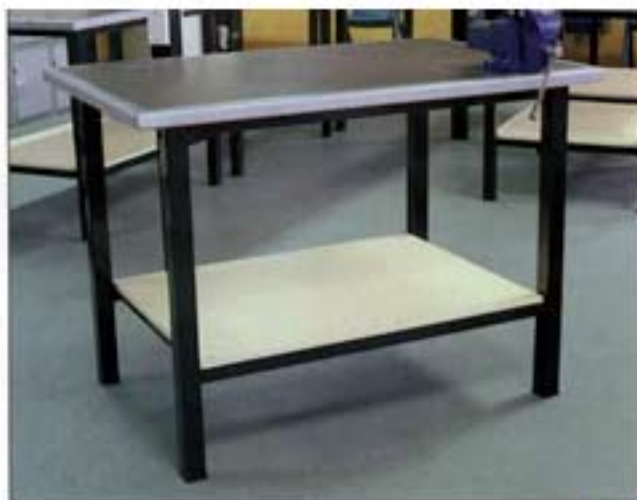
B-79 - Bench - Metalwork - 2 Station 1190 x 810 x 860 (Vices supplied separately)