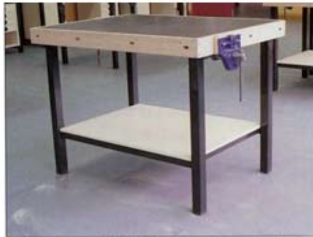
B-78 - Bench - Woodwork - 2 Station 1130 x 830 x 860 (Vices fitted to Bench)