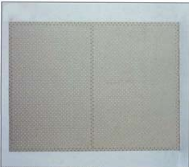
M-02 - Pegboard Panel 885x1180