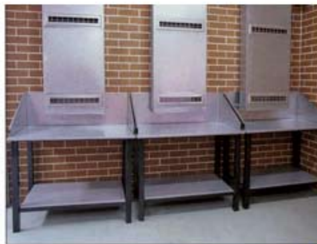
B-84 - Bench - Heat Treatment 1095 x 645 x 855 M-13 Shield Heat Treatment