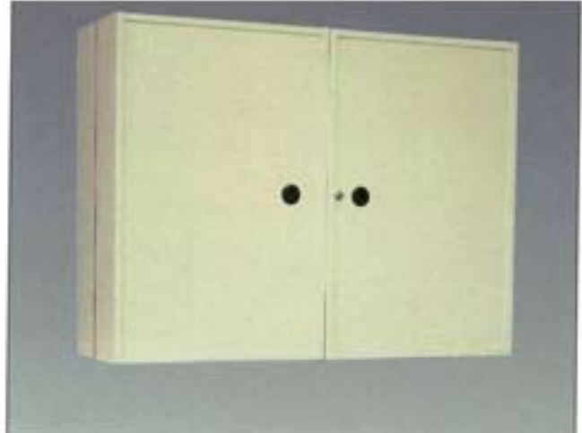
C-31 - Cabinet, Tool 1175 x 235 x 885