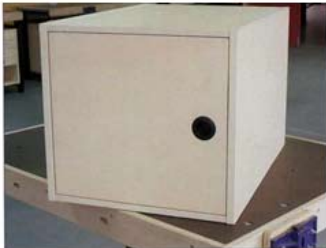
B-80 - Bench - Storage Cupboard 465 x 705 x 435