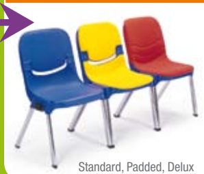
Standard, Padded, Delux