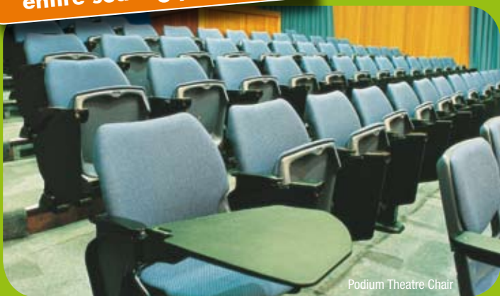
Podium Theatre Chair

We can help manage your entire seating project!