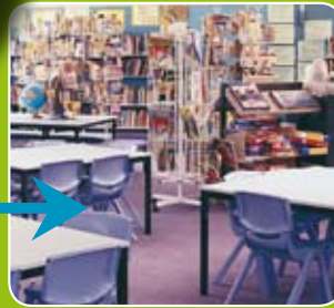
Full range of the most popular library accessories