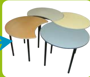
Stylish Orio tables are perfect for layout, working or reading!