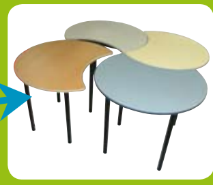
Stylish Orio tables are perfect for layout, working or reading!