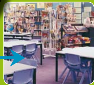
Full range of the most popular library accessories