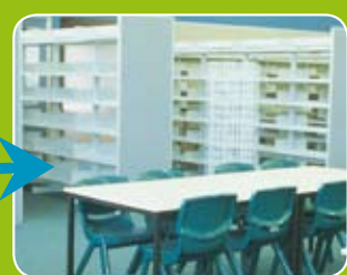
Sebel's colour coordinated library shelving system